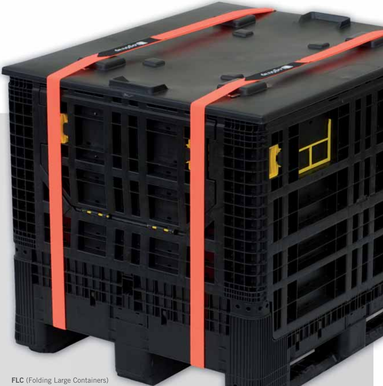
FLC (Folding Large Containers)